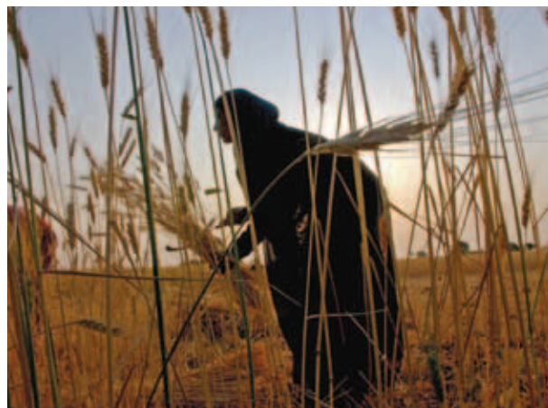
Harvesting wheat with a sickle, India